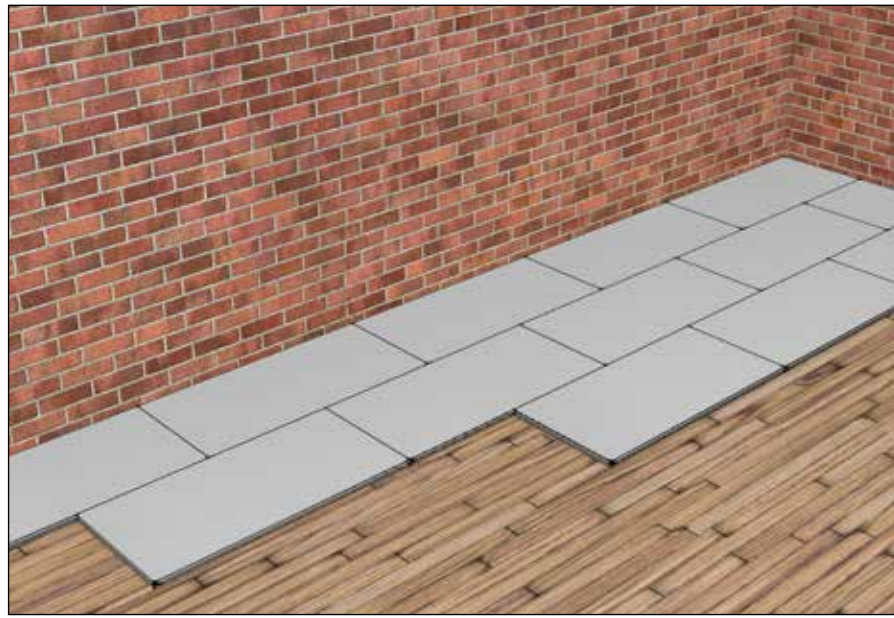
Fig. 4 Board installation pattern for Spacetherm Multi / Spacetherm A2 Multi

Spacetherm Multi / Spacetherm A2 Multi panels are loose-laid. Mechanical fixings must not be used to fix flooring panels to the underlying subfloor. Use Wraptite Tape to seal butt joints to control dust movement between adjacent panels. Optionally, Wraptite Tape may be used to seal the floor perimeter expansion strip. Surfaces to be taped should be as clean and dust-free as possible.