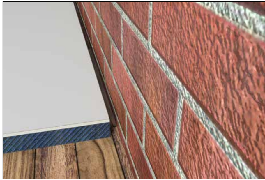
Fig. 6 Expansion gap at perimeter of Spacetherm Multi / Spacetherm A2 Multi

Allow for an expansion strip around the perimeter between Spacetherm Multi / Spacetherm A2 Multi and the wall or other abutments. The rate of expansion or contraction will depend on the moisture content of the boards, the laying conditions and the length of run. If required, small wedges can be placed between the Spacetherm Multi / Spacetherm A2 Multi boards or wall.