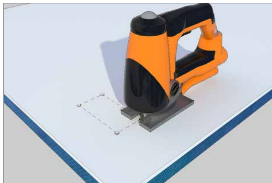
Fig. 3 Making cut-outs in Spacetherm Multi / Spacetherm A2 Multi

Cut outs required for pipework or other penetrations, if required, can be made by carefully measuring the location, then drilling the corners and cutting out with a jigsaw in the normal manner.