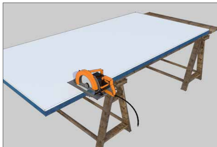
Fig. 2 Cutting Spacetherm Multi / Spacetherm A2 Multi Boards

Mechanical cutting is best done with a jigsaw or circular saw, whichever is most appropriate for the type of cut. Before cutting, ensure the board is adequately supported, and cuts should always be made from the internal face of the board (e.g. MgO side).