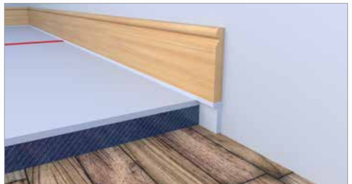
Fig 1 - Spacetherm Multi skirting detail