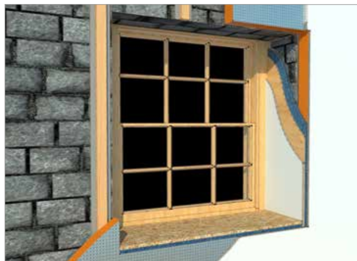
Image showing Spacetherm WRB applied internally to a reveal on an existing external wall structure.