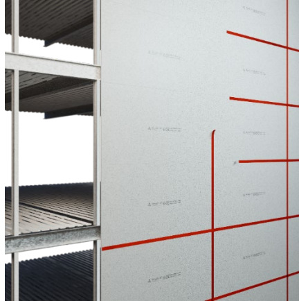
Diagram 2 - typical construction detail with tape