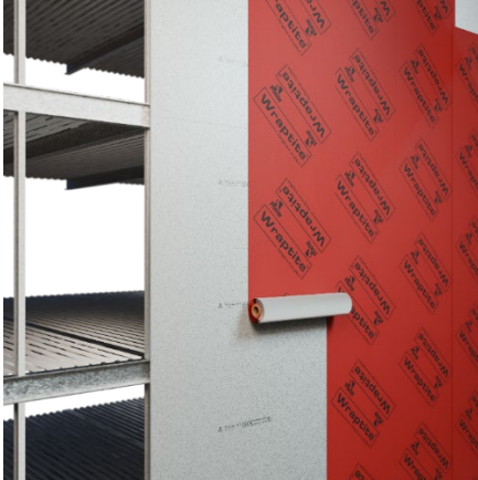
Diagram 1 - typical construction detail with breather membrane